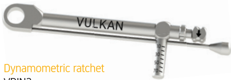
Dynamometric ratchet VDIN2

VSK2- CON-T Dynamometric ratchet VDIN Drivers 4X4 connection Drill Stoppers included